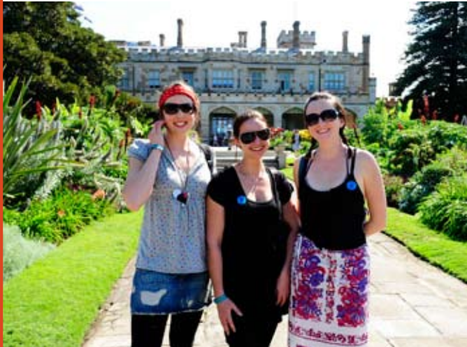
Above: Government House. Front cover image: Susannah Place Museum shop.

Or call T 02 8239 2211 to order tickets by post