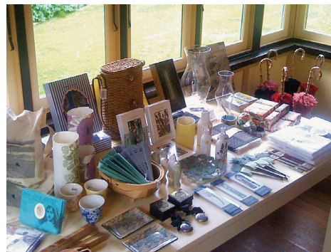
IMAGES: (FROM TOP) PREPARATIONS FOR DINNER. EXAMINING FRESH PRODUCE IN THE KITCHEN GARDEN. VAUCLUSE HOUSE TEAROOMS SHOP.