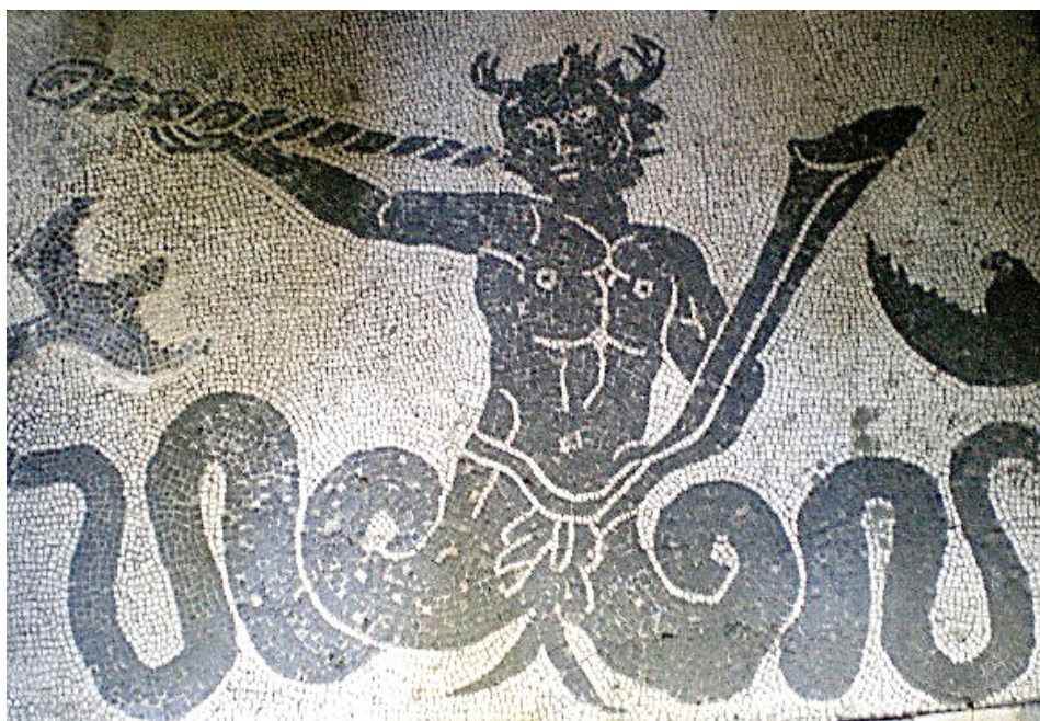
THE TRITON MOSAIC (DETAIL)

The Mausoleum, Chapel Rd, Vaucluse, will be open for viewing from 10am–3pm on Sunday 21 August for the centenary event.